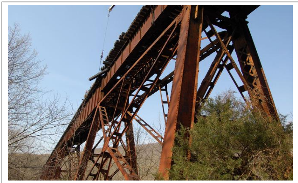
Using a truck-mounted derrick, workers slid in each tie under the rails one at a time. The trestle is 780 feet long and 117 feet high. Not the safest job in the world!