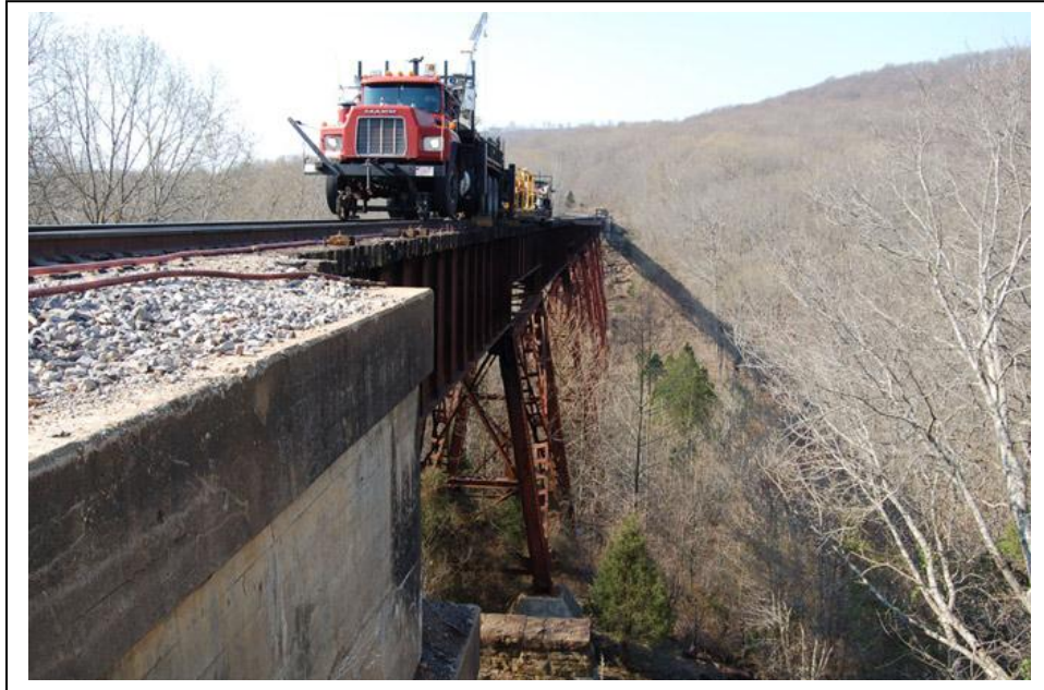
Workers use a rail-mounted truck with boom hoist to re-tie the 101 year-old Frisco Trestle.