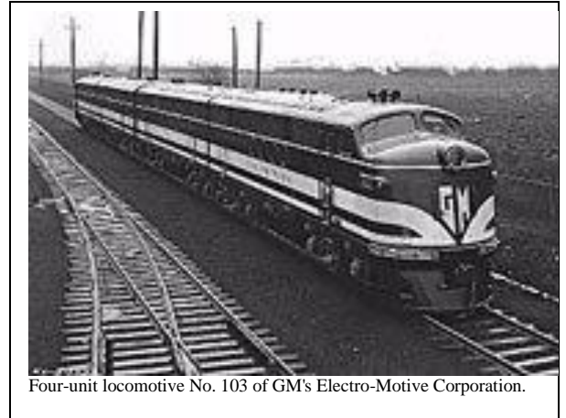
Four-unit locomotive No. 103 of GM's Electro-Motive Corporation.

Tagged "the diesel that did it" by David P. Morgan, longtime editor of Trains Magazine, in a 1960 feature story, four-unit locomotive No. 103 of General Motors' Electro-Motive Corporation was outshopped at a Grange, IL, plant in November 1939 (the firm later became GM's Electro-Motive Division). The four-unit machine-193 feet long, weighing 912,000 lbs., and rated 5,400 hp - was painted dark green with yellow. It toured 20 railroads in 35 states, rolling out 83,764 miles in 11 months, and was so successful that it is considered the largest single factor that pointed U.S. railroads toward total dieselization, accomplished about two decades later. One cab from this quartet is preserved at St. Louis's Museum of Transportation. A total of 1,096 FT's were sold.