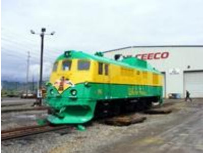
White Pass & Yukon shovelnose diesel No. 98 sits outside Coast Engine & Equipment Co. in Tacoma, Wash.

TACOMA, Wash. - Coast Engine & Equipment Co. has begun turning out rebuilt White Pass & Yukon 3-foot-gauge shovelnose diesels. When the project is done, WP&Y's entire shovelnose fleet will cycle through the program.