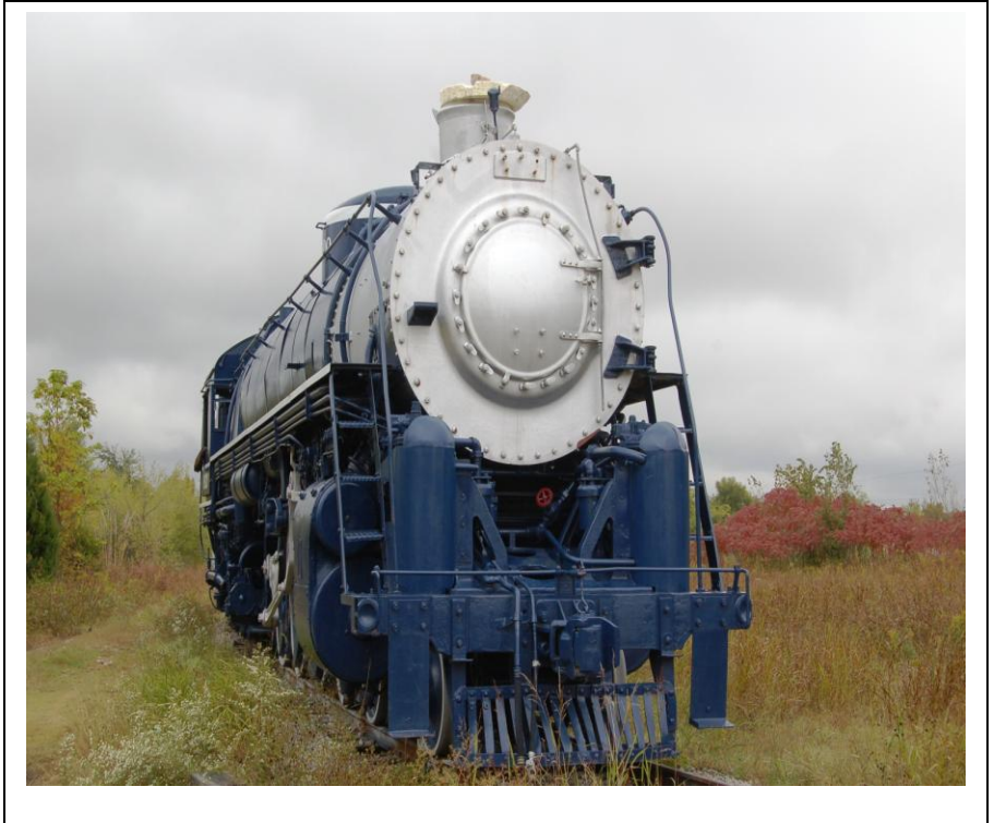
A photo of Frisco 4524 at Grant Beach Park, Springfield, Mo.

Our last month's program featured member's Show and Tell during which an excellent variety of railroad related items were shown and discussed. One of the items was a print of a painting by Charles Summey depicting a winter night scene from the 20's or 30's with a Frisco RR 4-8-4, No. 4524 stopped at the Rogers, Arkansas depot. Almost immediately, huge flaws in its historical accuracy were noted. Geologist Bob Oswald noted that the painting put the moon to the north of Rogers placing the depot on the west side of the tracks instead of its actual location on the east side. Others doubted that a locomotive that size could have ever passed through Rogers given the weight limitation of the track and bridges. Tom Duggan went further and researched the following and sent it to us by e-mail: