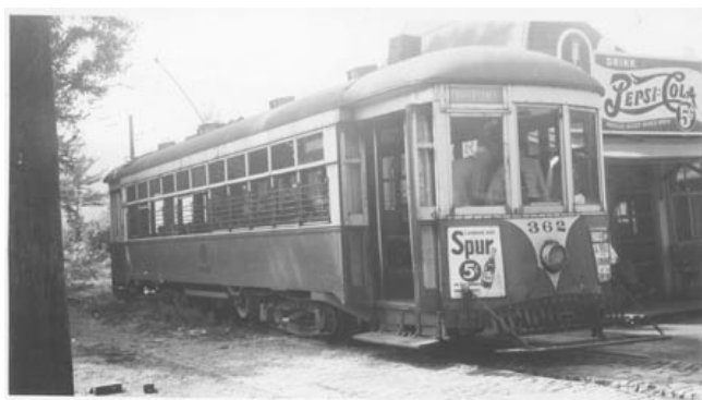
Johnstown 362, seen here in service in the 1940s, has been delivered to the Johnstown Area Heritage Association for restoration.