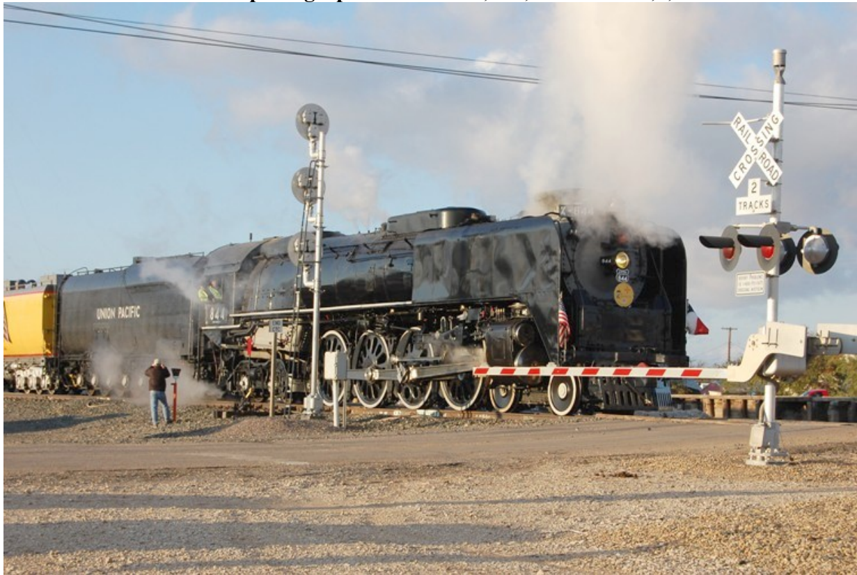
UP 844 photographed in Liberal, KS, November 1,2,3