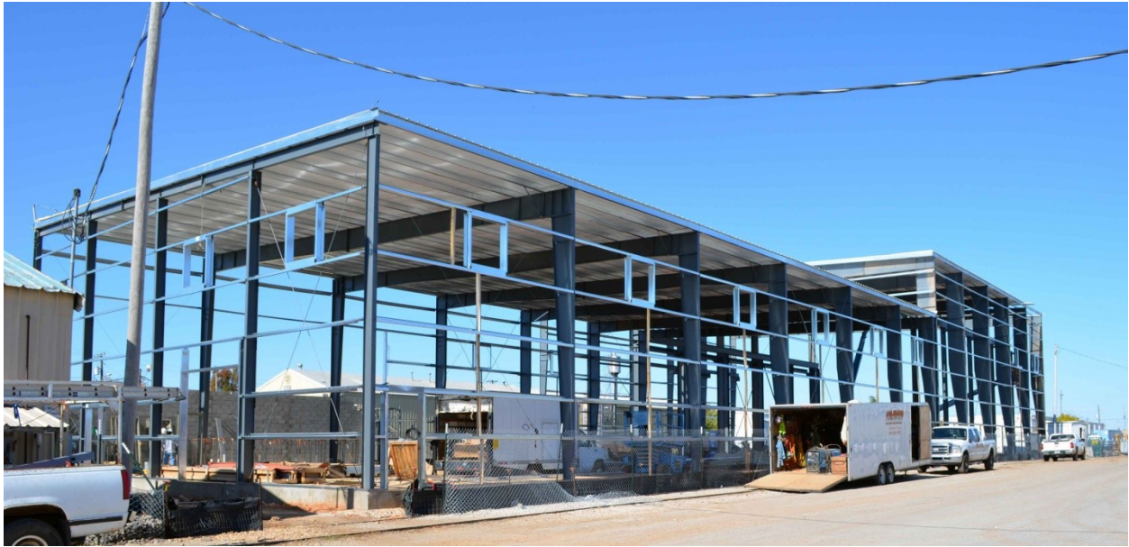
November 12: